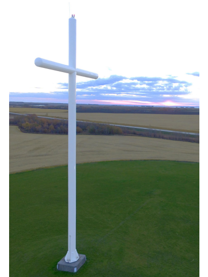
MILLENNIUM 2000 CROSS

10.8 km north east of Aberdeen, SK on Highway 41