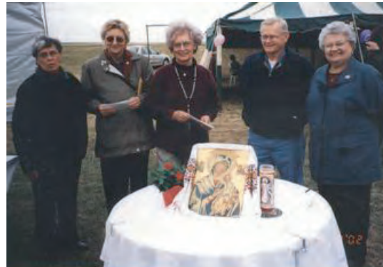
Confraternity of Our Mother of Perpetual Help