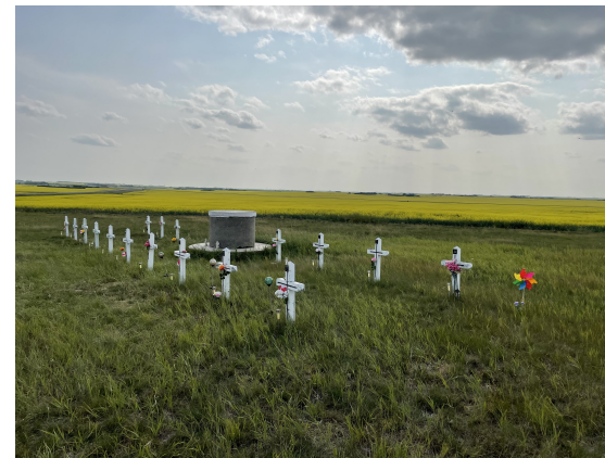
Memorial crosses for miscarried babies

THE MILLENNIUM PRO-LIFE CROSS FOUNDATION INC.