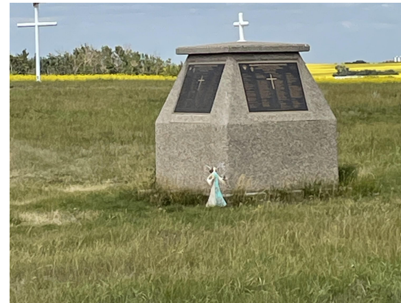
Two bronze donors' plaques on a concrete cairn at the cross site