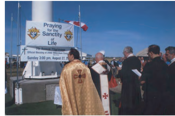
Aug. 27, 2006: Bishop Wiwchar blesses the cross