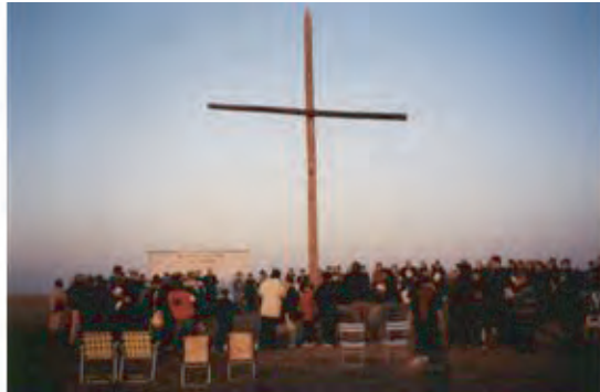
Oct. 15, 2000: The first annual pilgrimage